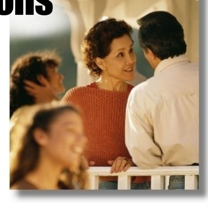
table. Try the following tips to help make your get-togethers a little merrier: 1) steer conversations that appear to be drifting into conflict toward those things you can agree on; 2) if you are angry about what's in the news, avoid displacing this tension onto loved ones; 3) challenge yourself to be a tension deescalator, not an aggravator; and 4) rehearse how you might respond to conflict because doing so will dramatically improve your ability to act calmly while avoiding hair-trigger reflexes.

he annual Stress in America survey consistently reports strain among families caused by their ideological differences, and the holidays have a keen reputation for these conflicts, even at the dinner